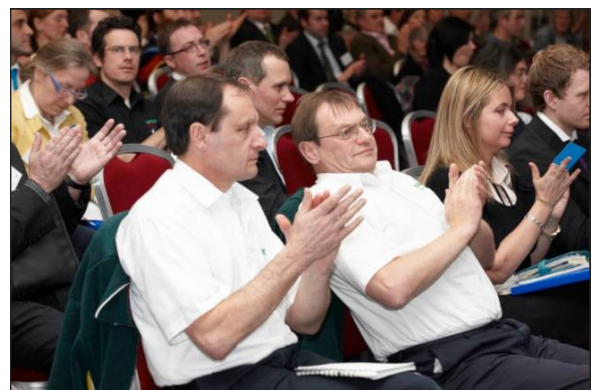
Conference delegates enjoyed the stimulating speakers

Many found the event motivating and an ideal opportunity to witness firsthand the influential work happening across the sector. The event gave the Partnership a big boost and there are already plans to build on this, including a new website and a future conference in 2011.