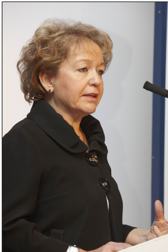
Rt Hon Rosie Winterton MP

Services. The partnership's key objective is to encourage the expansion of renewable technologies at a local, regional and national level. The Partnership has now grown to around 25 organisations, employing over 300 staff, representing installers, manufacturers and others involved in the Microgeneration industry across the region.